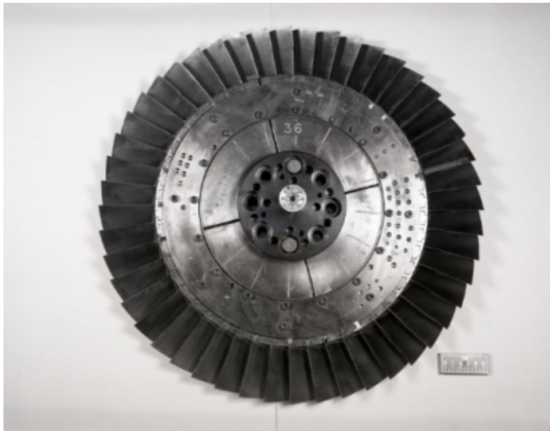
Fig. 1 https://catalog.archives.gov/id/17467913