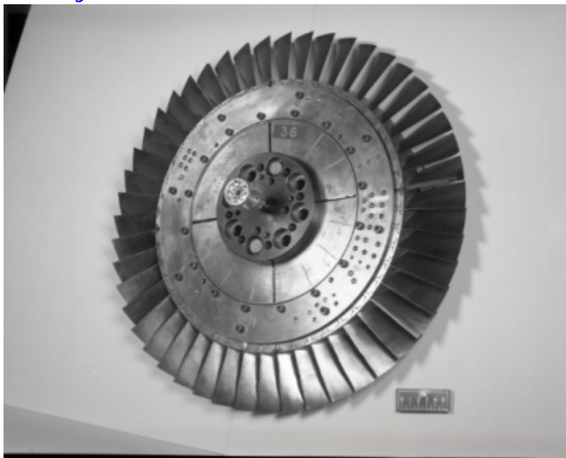
Fig. 2 https://catalog.archives.gov/id/17467884