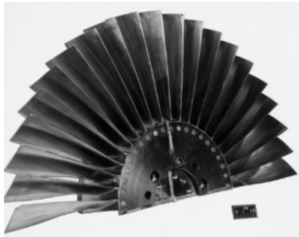
Fig. 1 https://catalog.archives.gov/id/17444857