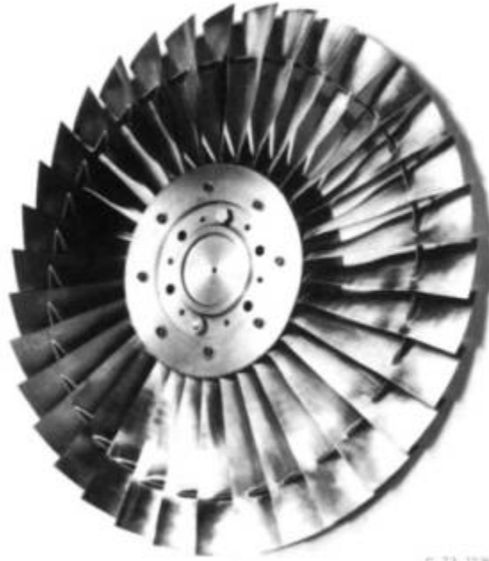
Fig1. https://ntrs.nasa.gov/citations/19760017065 p.114