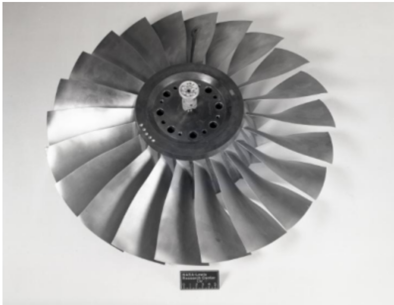
Fig. 1 https://catalog.archives.gov/id/17500556