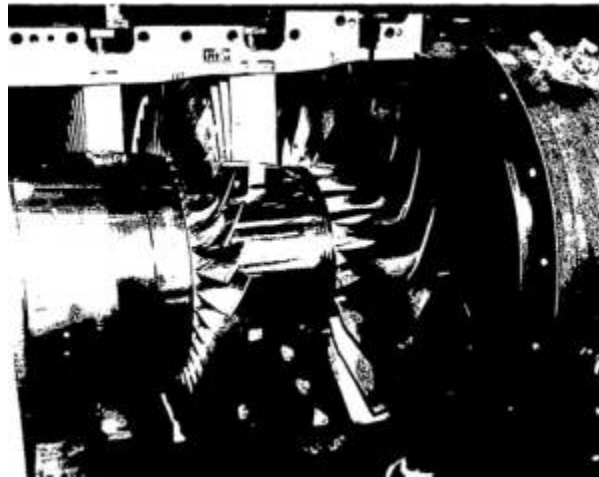
Fig. 1 https://ntrs.nasa.gov/citations/19790018972 p.119