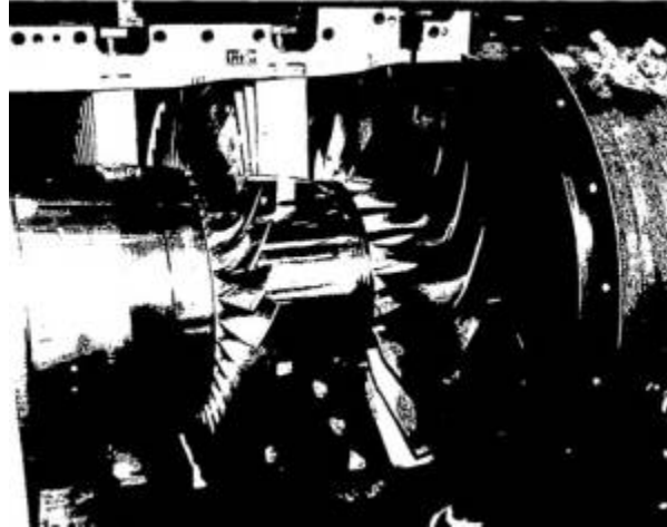
Fig. 1 https://ntrs.nasa.gov/citations/19790018972 p.119